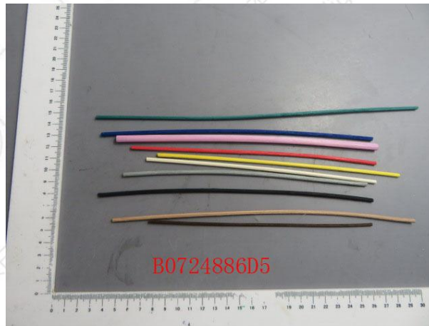
Pony authenticate the photo on original report only ——The page below is blank——